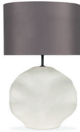
CHANDRA SMALL TABLE LAMP

Styled in the same visual language as Hubble, Chandra marks another voyage of discovery—a mission to uncover the universe using X-Rays by the Chandra X-Ray Observatory. The mesmerizing images sent back from the space probe capture far off whirling galaxies, eddying and spiralling whilst seeming completely motionless, a concept we chose to encapsulate with this mini-series of ceramic table lamps.