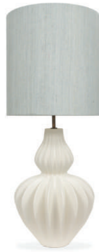
OPTIC TABLE LAMP

Named in reference to the starburst rays of light which crown stars in astrophotography, the birds eye view of our Optic table lamp reveals a superb structure which visually represents these light optics. Viewed from the side the visual concept which inspired this design is totally disguised, but this new dimension offers a totally unique play on the original inspiration and gives a transitional look as the ceramic fins carve out a traditional shape in an ultra-modern style. A triumph of this collection, the Optic table lamp makes a convincing entrance to our collection in three statement looks; Chalk, Jasper and Oil.