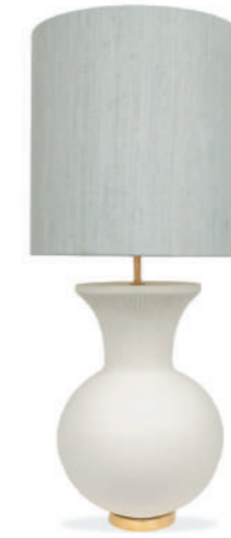
HALLEY TABLE LAMP

The Halley table lamp is a stylised impression of the most famous comet to grace our skies, Halley's comet. This comet is a rare thing to behold but with a famous reputation for its everlasting presence. To honour 'Halley' honestly was to create a design that would stand the test of time, something that answers to both traditional and modern tastes in one and is in effect timeless.