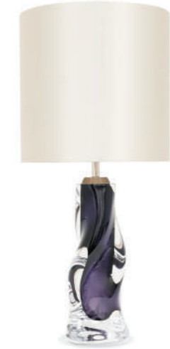
VORTEX TABLE LAMP TL816 INDIGO & WITH 10" DRUM SHADE 12CM [4.7"] DIAMETER X 35.4CM [13.9"] HIGH