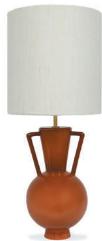
ATHENA TABLE LAMP

TL823 CRACKLE & OLD ENGLISH WITH 12" TALL DRUM SHADE 20.5CM [8.1"] DIAMETER X 46.3CM [18.2"] HIGH