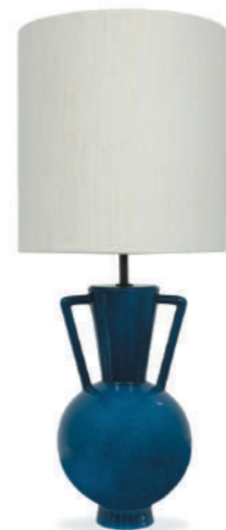
ATHENA TABLE LAMP

TL823 TABASCO & POLISHED BRASS WITH 12" TALL DRUM SHADE 20.5CM [8.1"] DIAMETER X 46.3CM [18.2"] HIGH