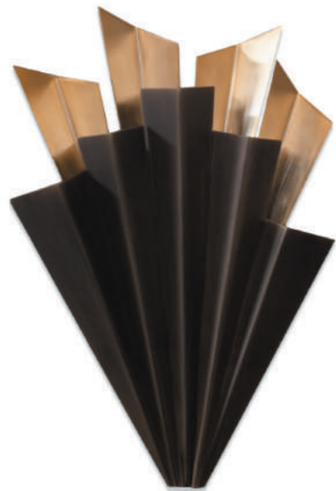
SUNSHINE LARGE WALL LIGHT

WL812-SM BRUSHED GOLD 22.5CM [8.9"] WIDE X 36.5CM [14.4"] HIGH X 5.5CM [2.2"] DEEP