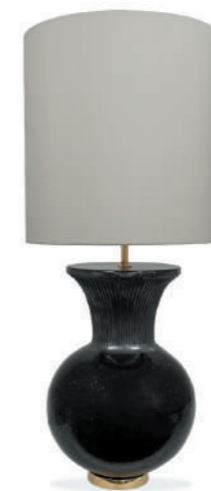
HALLEY TABLE LAMP

TL820 CRACKLE & POLISHED BRASS WITH 14" TALL DRUM SHADE 28CM [11"] DIAMETER X 50.3CM [19.8"] HIGH