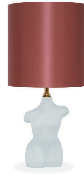
VENUS TABLE LAMP

Goddess of love and beauty, Venus encompasses femininity and will bring a graceful presence to your interior setting. This refined sculpture is honed from solid Italian glass and embellished with brass fixings. We offer Venus in clear glass for a gentler aura or a satin finish which echoes the glowing presence of her namesake planet, the brightest object in our night sky beyond the Moon, a true object of desire.