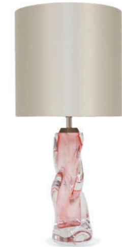
VORTEX TABLE LAMP TL816 ROSALINE & WITH 10" DRUM SHADE 12CM [4.7"] DIAMETER X 35.4CM [13.9"] HIGH