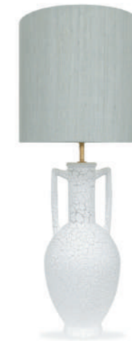
AMPHORA TABLE LAMP

TL824 TABASCO & BRONZE WITH 13" TALL DRUM SHADE 21.5CM [8.5"] DIAMETER X 57.8CM [22.8"] HIGH