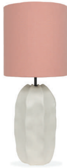
BOLIDE TABLE LAMP

Aster's bigger brother, Bolide, is a model conceptionally based upon a giant meteor often seen as a fireball as it glides through the atmosphere like a missile. The core silhouette is decorated with rippling fins which offer subtle structure to an attractively organic form.