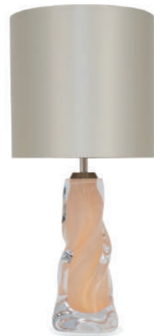
VORTEX TABLE LAMP TL816 BALLET & WITH 10" DRUM SHADE 12CM [4.7"] DIAMETER X 35.4CM [13.9"] HIGH