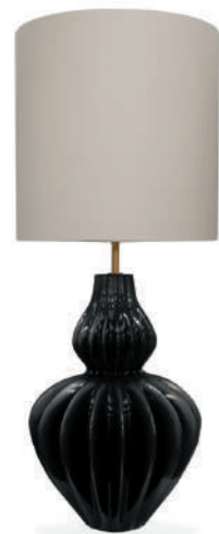
OPTIC TABLE LAMP

TL825 CHALK & OLD ENGLISH WITH 14" TALL DRUM SHADE 31.5CM [12.4"] DIAMETER X 54.8CM [21.6"] HIGH