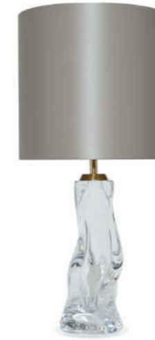
VORTEX TABLE LAMP TL816 CLEAR & WITH 10" DRUM SHADE 12CM [4.7"] DIAMETER X 35.4CM [13.9"] HIGH