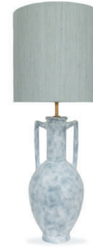
AMPHORA TABLE LAMP

TL824 DAPPLE GREY & POLISHED BRASS WITH 13" TALL DRUM SHADE 21.5CM [8.5"] DIAMETER X 57.8CM [22.8"] HIGH