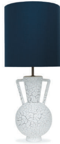
ATHENA TABLE LAMP

An ode to the deity, Athena, a goddess of wisdom and craft. This contemporary model is styled on the traditional form of a Greek amphora with exaggerated, angular arms in stark contrast to its rounded body. Athena is an adaptable statement piece which possesses the ability to claim focus or quietly set the tone of its setting depending upon the selection of finishes.