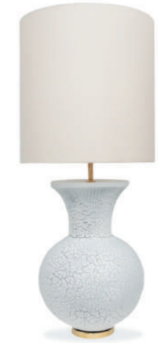
HALLEY TABLE LAMP

TL820 CHALK & POLISHED BRASS WITH 14" TALL DRUM SHADE 28CM [11"] DIAMETER X 50.3CM [19.8"] HIGH