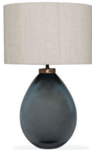
GIBBOUS TABLE LAMP

TL815 MAHOGANY & ANTIQUE GOLD WITH 16" STRAIGHT OVAL SHADE 28CM [15.4"] WIDE X 47.7CM [19"] HIGH X 14CM [5.5"] DEEP