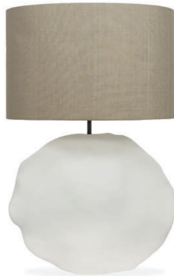
CHANDRA LARGE TABLE LAMP

TL817-SM WARM WHITE & BRONZE WITH 15" STRAIGHT OVAL SHADE 34CM [13.4"] WIDE X 39.8CM [15.7"] HIGH X 11CM [4.3"] DEEP