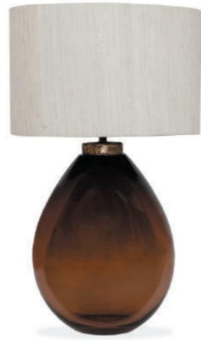
GIBBOUS TABLE LAMP

There is no celestial body as prominent in the night sky than our humble Moon, its faithful presence is one we consider with wonderment and awe. The Gibbous table lamp is made in tribute to the mysterious spirit of our lunar companion; a generous hand-blown glass body in three shadowy tones paired with a textured and gilded neck which echoes the rocky surface of The Moon. Owed to its flattened form and slim oval lampshade, Gibbous is perfectly suited to console tables and narrower spaces.