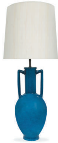
AMPHORA TABLE LAMP

The Amphora table lamp pays homage to ancient civilisations who bestowed the names of their gods and goddesses on some of the celestial bodies we can witness with the naked eye. The naming of these astronomical discoveries gives them personified characteristics which in turn gave us inspiration for a number of the works included in this collection. An Amphora, chic and strong in silhouette, was often rewarded to victors in contests such as the Panathenaic games, thus the symbol of praise we chose to honour these ancient discoveries.