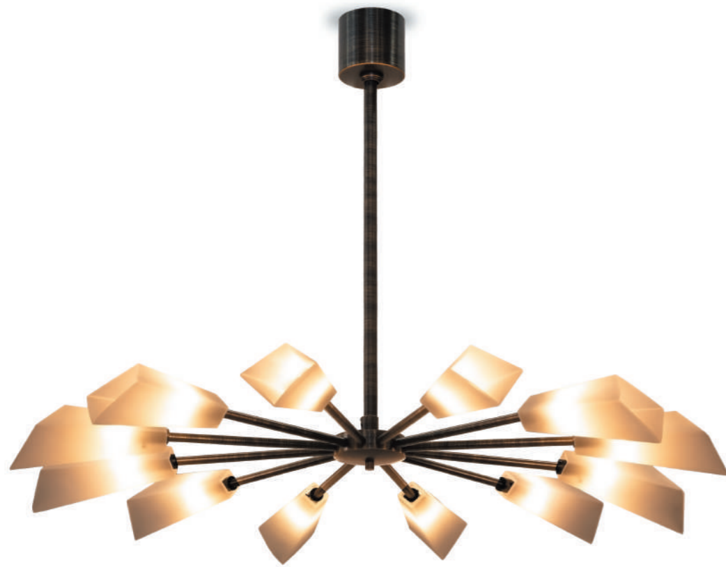
SOL CHANDELIER CL804-100 SATIN & ANTIQUE BRUSHED BRASS 100CM [39.4"] DIAMETER X 8.6CM [3.4"] HIGH

Humans have long illustrated the sun with a simplified image of a central circle surrounded by lines as rays which frame it. Sol, which takes its name from a sun god, plays on this universally recognised symbol for the Sun with arms that project out from a central point, each ending with a piece of hand-blown flared glass. A simple but joyful piece especially designed to suit those with low ceilings.