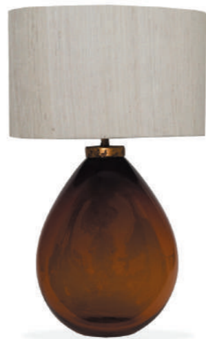
GIBBOUS TABLE LAMP

TL815 MIDNIGHT & ANTIQUE GOLD WITH 16" STRAIGHT OVAL SHADE 28CM [15.4"] WIDE X 47.7CM [19"] HIGH X 14CM [5.5"] DEEP