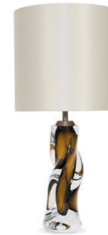
VORTEX TABLE LAMP TL816 AMBER & WITH 10" DRUM SHADE 12CM [4.7"] DIAMETER X 35.4CM [13.9"] HIGH