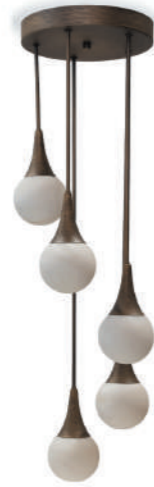
JUPITER MINI CLUSTER

Jupiter represents an authentic connection with the heavenly bodies which are granted the names of ancient deities and symbolize immense power and greatness. This showstopping alabaster pendant glows hypnotically in genuine likeness to the largest planet in our solar system, Jupiter. The options are endless with this series, we offer 2 standard sizes; both a generous open bottomed ceiling light which is truly spectacular and a dainty, miniature globe pendant which is enclosed at the base and can be styled as a single pendant or a cluster for big impact.