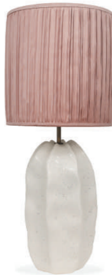
BOLIDE TABLE LAMP

TL822 CHALK & BRONZE WITH 12" TALL DRUM SHADE 22.5CM [8.6"] DIAMETER X 47.3CM [18.6"] HIGH