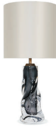
VORTEX TABLE LAMP TL816 MIDNIGHT & WITH 10" DRUM SHADE 12CM [4.7"] DIAMETER X 35.4CM [13.9"] HIGH

Each Vortex table lamp is a unique art form. No two pieces are exactly the same, owing its sculptural form to a completely handmade, mould-free creation which allows for the unconstrained formation of each lamp's graceful twists and folds. We find ourselves entranced by the frozen fluidity of the Vortex glass, which evokes contemplation with its extraordinary beauty.