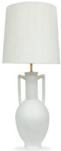
AMPHORA TABLE LAMP

TL824 STARRY SKY & BRONZE WITH 13" WALTON SHADE 21.5CM [8.5"] DIAMETER X 57.8CM [22.8"] HIGH