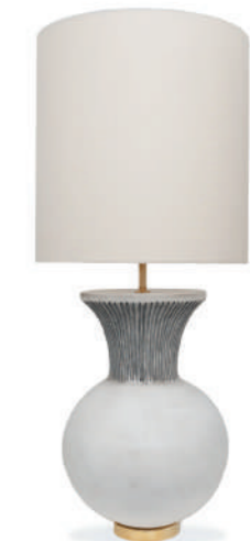
HALLEY TABLE LAMP

TL820 OIL & POLISHED BRASS WITH 14" TALL DRUM SHADE 28CM [11"] DIAMETER X 50.3CM [19.8"] HIGH