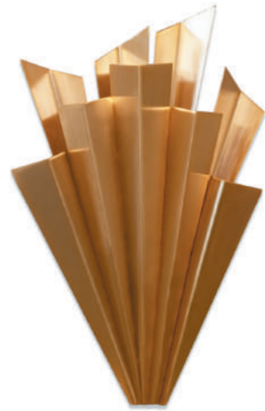
SUNSHINE SMALL WALL LIGHT

With Bella Figura's characteristic fascination with the Art Deco design movement in mind, the Sunshine wall lights feature a simplistic and geometric impression of sunbeams. When lit, these wall lights throw soft rays of light across the wall and offer a sense of cheerful glamour. This wall light can be completed in a single brushed finish or a combination of two to add extra depth to this majestic style.