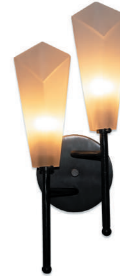
SOL 2 WALL LIGHT WL804-2 ALABASTER & BRONZE 18.7CM [7.4"] WIDE X 44.3CM [17.4"] HIGH X 12.1CM [4.8"] DEEP