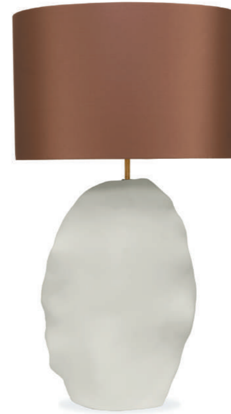
HUBBLE TABLE LAMP

The undulating contours of this table lamp are reminiscent of the 1995 photo "Pillars of Creation" taken by The Hubble Space Telescope, an image that is mesmerizingly out of this world. Statuesque and certain, this design is not one to blend in.