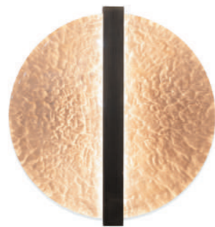
MANTLE WALL LIGHT

CL810-PEN CLEAR SATIN & BRUSHED GOLD 31CM [12.2"] WIDE X 31CM [12.2"] HIGH X 3.6CM [1.4"] DEEP