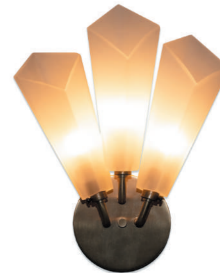
SOL 3 WALL LIGHT WL804-3 ALABASTER & BRUSHED GOLD 39CM [15.4"] WIDE X 39.5CM [15.6"] HIGH X 12.1CM [4.8"] DEEP