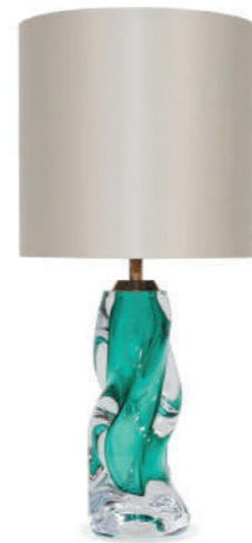
VORTEX TABLE LAMP TL816 CELESTE & WITH 10" DRUM SHADE 12CM [4.7"] DIAMETER X 35.4CM [13.9"] HIGH