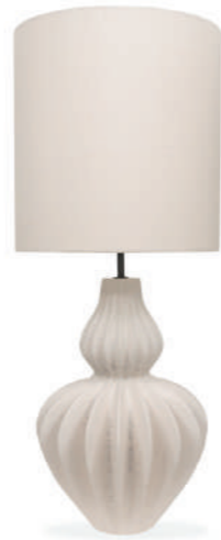
OPTIC TABLE LAMP

TL825 OIL & POLISHED BRASS WITH 14" TALL DRUM SHADE 31.5CM [12.4"] DIAMETER X 54.8CM [21.6"] HIGH