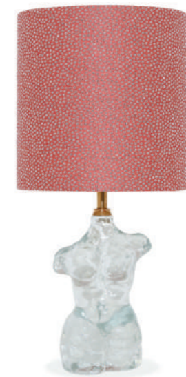
VENUS TABLE LAMP

TL814 SATIN & POLISHED BRASS WITH 9" TALL DRUM SHADE 13CM [5.1"] WIDE X 28.5CM [11.2"] HIGH X 8.5CM [3.3"] DEEP