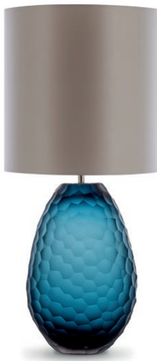
EYRE TABLE LAMP

TL235 BRONZE & BRUSHED BRASS 20.5CM [8"] WIDE X 16.5CM [6"] DEEP X 37.5CM [15"] HIGH SHOWN WITH 11" TALL DRUM SHADE