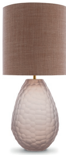
EYRE TABLE LAMP

TL235 OCEAN BLUE & BRUSHED NICKEL 20.5CM [8"] WIDE X 16.5CM [6"] DEEP X 37.5CM [15"] HIGH SHOWN WITH 11" TALL DRUM SHADE