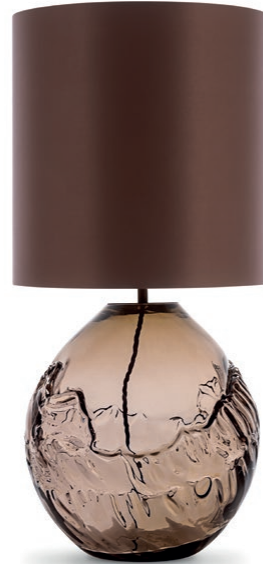
CREST TABLE LAMP

CLEAR & BRUSHED GOLD 28CM [11"] DIAMETER X 37.5CM [15"] HIGH SHOWN WITH 12" TALL DRUM SHADE