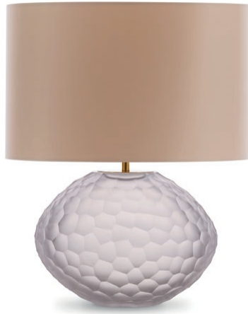
ATACAMA TABLE LAMP TL234 CLEAR & BRUSHED GOLD 27CM [11"] WIDE X 22CM [9"] DEEP X 27.5CM [11"] HIGH SHOWN WITH 15" OVAL DRUM SHADE

An extra-terrestrial landscape of pink birds and imposing rock formations, eerie pockets of water bubbling and jets of steam bursting into the sky. Most unusual of all is the vast white jigsaw spanning as far as the eye can see, the salt flats of Atacama. Our new design of the same name retraces the natural pattern scored through this salt mosaic in a delightful array of glass colours.