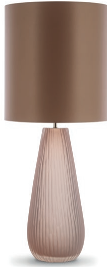
TUPELO TABLE LAMP

TL237 BRONZE & BRUSHED BRASS 17CM [7"] DIAMETER X 45CM [18"] HIGH SHOWN WITH 12" TALL DRUM SHADE