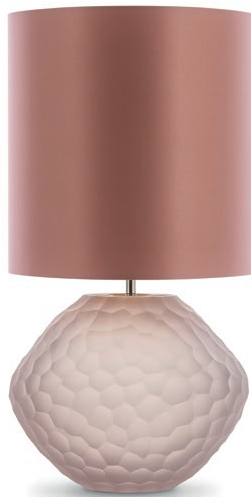
ATACAMA TABLE LAMP TL234 BLUSH PINK & BRUSHED NICKEL 27CM [11"] WIDE X 22CM [9"] DEEP X 27.5CM [11"] HIGH SHOWN WITH 11" TALL DRUM SHADE