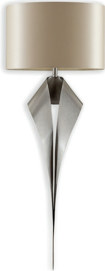
DART WALL LIGHT

Deep in a wooded coombe to the south of Dartmoor, gnarled hawthorns and verdurous canopies veil a twin cascade of white water. Bordered by banks festooned in tall ferns, the River Dart's secret sanctuary - Venford Falls. The converging channels of our Dart wall light translate this tranquil haven into a satisfyingly sleek sculpture, which will bring graceful adornment to any interior.