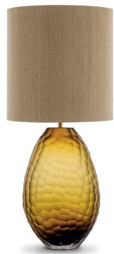
EYRE TABLE LAMP

TL235 BLUSH PINK & BRUSHED GOLD 20.5CM [8"] WIDE X 16.5CM [6"] DEEP X 37.5CM [15"] HIGH SHOWN WITH 11" TALL DRUM SHADE