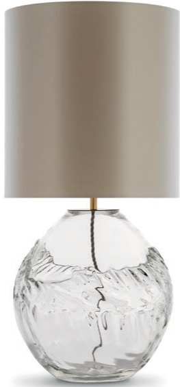
CREST TABLE LAMP

All the drama and energy of surging seas; crashing and whirling waves, frozen in their capricious path. A theatrical storm has been skilfully manipulated from molten glass, suspending this animated force of nature within a tempestuous capsule, each unique in its fluid form.