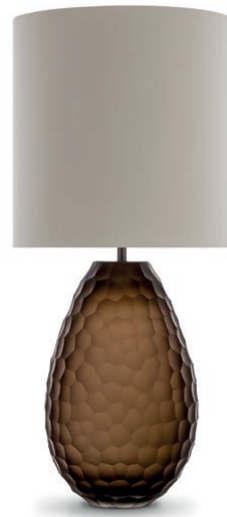
EYRE TABLE LAMP

TL235 CLEAR & BRUSHED NICKEL 20.5CM [8"] WIDE X 16.5CM [6"] DEEP X 37.5CM [15"] HIGH SHOWN WITH 11" TALL DRUM SHADE