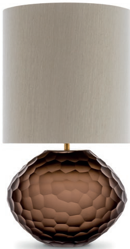
ATACAMA TABLE LAMP TL234 BRONZE & BRUSHED GOLD 27CM [11"] WIDE X 22CM [9"] DEEP X 27.5CM [11"] HIGH SHOWN WITH 11" TALL DRUM SHADE