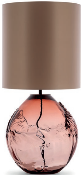
CREST TABLE LAMP

BRONZE & BRUSHED DARK BRONZE 28CM [11"] DIAMETER X 37.5CM [15"] HIGH SHOWN WITH 12" TALL DRUM SHADE