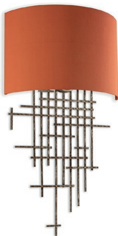
MONDRIAN WALL LIGHT

CL59 HAMMERED ANTIQUE GOLD LEAF 75CM [30"] DIAMETER X 29CM [11"] HIGH