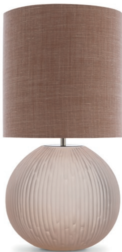
CYPRESS TABLE LAMP

TL236 CLEAR & BRUSHED GOLD 27CM [10,5"] DIAMETER X 31CM [12"] HIGH SHOWN WITH 11" TALL DRUM SHADE