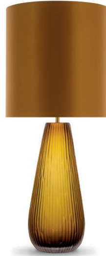
TUPELO TABLE LAMP

TL237 CLEAR & BRUSHED NICKEL 17CM [7"] DIAMETER X 45CM [18"] HIGH SHOWN WITH 12" TALL DRUM SHADE