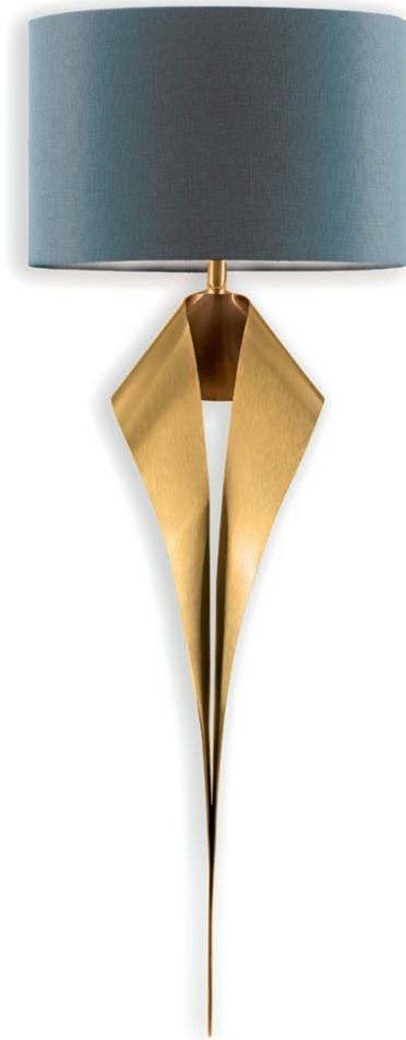
DART WALL LIGHT

WL392 BRUSHED NICKEL 15CM [6"] WIDE X 16.5CM DEEP [6.5"] X 57.5CM [22.5"] HIGH SHOWN WITH A 10" OVAL SHADE