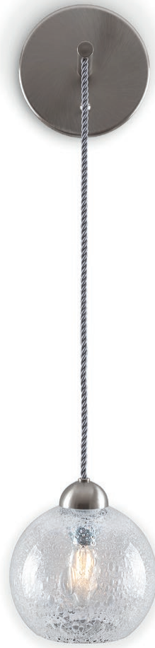
FOSS WALL LIGHT

WL376 BATTUTO LEAD CRYSTAL & BRUSHED DARK BRONZE 14.5CM [6"] WIDE X 23.5CM [9.5"] DEEP