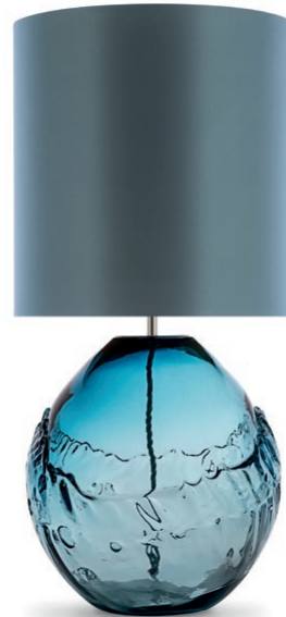
CREST TABLE LAMP

TEA & BRUSHED DARK BRONZE 28CM [11"] DIAMETER X 37.5CM [15"] HIGH SHOWN WITH 12" TALL DRUM SHADE