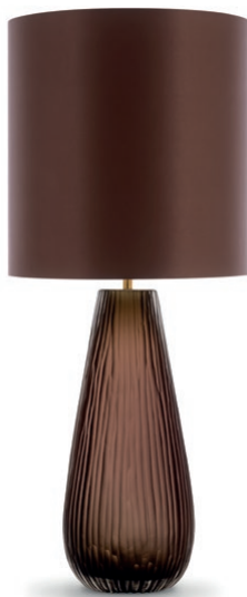
TUPELO TABLE LAMP

TL237 AMBER & BRUSHED BRASS 17CM [7"] DIAMETER X 45CM [18"] HIGH SHOWN WITH 12" TALL DRUM SHADE