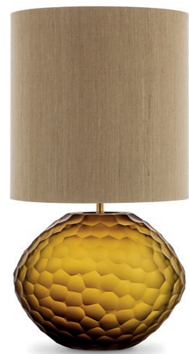
ATACAMA TABLE LAMP TL234 AMBER & BRUSHED GOLD 27CM [11"] WIDE X 22CM [9"] DEEP X 27.5CM [11"] HIGH SHOWN WITH 11" TALL DRUM SHADE

Total Height with 15" Oval Shade: 48cm [19"] Total Height with 11" Tall Drum Shade: 52cm [20,5"] As these glass lamps are handmade by our artisans in England, they may vary slightly in dimension and appearance