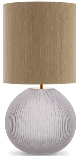
CYPRESS TABLE LAMP

TL236 AMBER & BRUSHED BRASS 27CM [10,5"] DIAMETER X 31CM [12"] HIGH SHOWN WITH 11" TALL DRUM SHADE