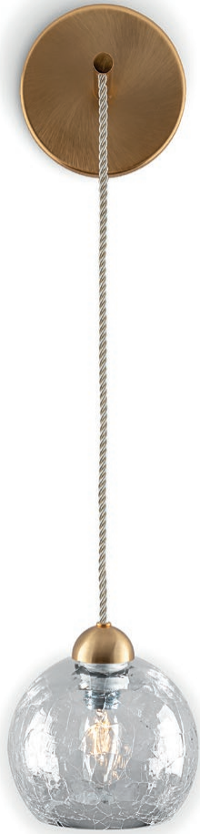
ARCTIC WALL LIGHT

The Contour Collection favourites, Arctic and Glacier have made a comeback this year bringing with them a new addition, Foss, as they form a triptych of wall pendants. Foss, meaning waterfall, is representative of rushing white water, hundreds of bubbles trapped within an effervescent glass dome. All three glass designs are available with Brushed Nickel, Brushed Gold or Brushed Dark Bronze detailing and can be ordered with or without a stylish dolly switch, perfect for bedside placement.