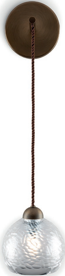
GLACIER WALL LIGHT

WL375 CRACKLE LEAD CRYSTAL & BRUSHED GOLD 14.5CM [6"] WIDE X 23.5CM [9.5"] DEEP