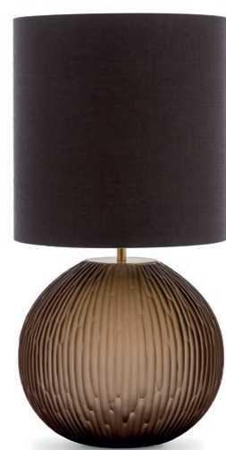
CYPRESS TABLE LAMP

TL236 OCEAN BLUE & BRUSHED BRASS 27CM [10,5"] DIAMETER X 31CM [12"] HIGH SHOWN WITH 11" TALL DRUM SHADE