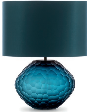
ATACAMA TABLE LAMP TL234 OCEAN BLUE & BRUSHED NICKEL 27CM [11"] WIDE X 22CM [9"] DEEP X 27.5CM [11"] HIGH SHOWN WITH 15" OVAL DRUM SHADE