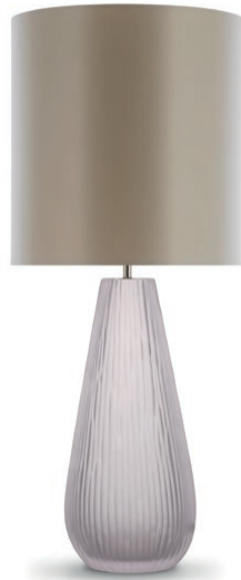
TUPELO TABLE LAMP

The Tupelo tree towers above all, an ancient sentinel keeping its silent vigil at the waters edge and proudly displaying its cragged and banded bark. Our Tupelo table lamp is garbed in a coat of chiselled grooves which echo those of the monumental tree.