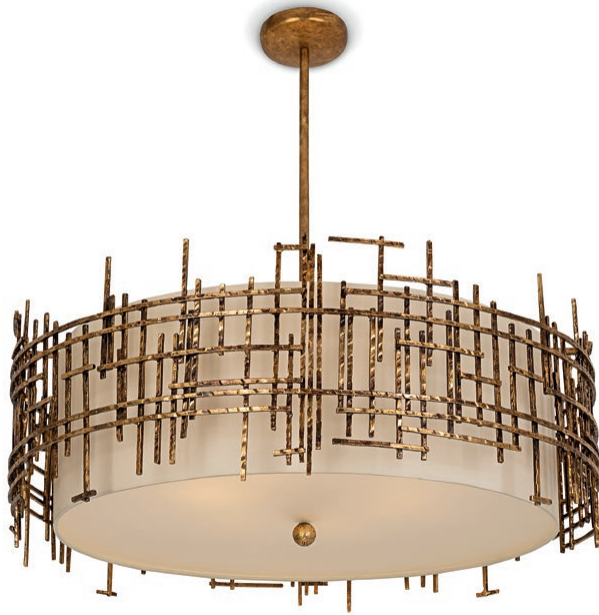
MONDRIAN CEILING LIGHT

Mondrian's Pier and Ocean series describes a gradual abstraction of a waterfront scene, simplifying oblique and indistinct details into parallel, rhythmic lines, which describe the pulse of the ocean. Our Mondrian family is heavily influenced by this astute observation of the underlying patterns in nature and the unending movement of water, drawing on these qualities of order and balance to create these sculpted pieces.