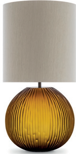
CYPRESS TABLE LAMP

The Giant Bald Cypress tree is one of stalwart stature, rooted deep in the mangrove and keeping watch over an oasis of tranquillity and stillness. The Cypress trees rotund form and complex root structure is emulated in our Cypress table lamp; an understated spherical piece with hand-carved glass furrows, acid dipped for an enchanting frosted look.