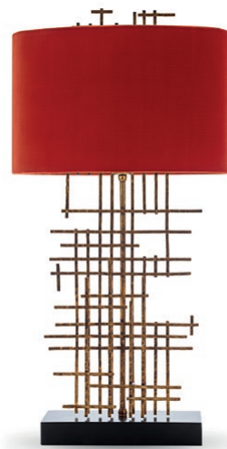
MONDRIAN TABLE LAMP

WL59 HAMMERED ANTIQUE SILVER LEAF 34.5CM WIDE [14"] X 7.5CM DEEP [3"] X 57.5CM [23"] HIGH