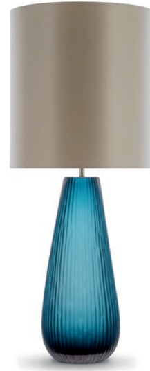
TUPELO TABLE LAMP

TL237 BLUSH PINK & BRUSHED NICKEL 17CM [7"] DIAMETER X 45CM [18"] HIGH SHOWN WITH 12" TALL DRUM SHADE