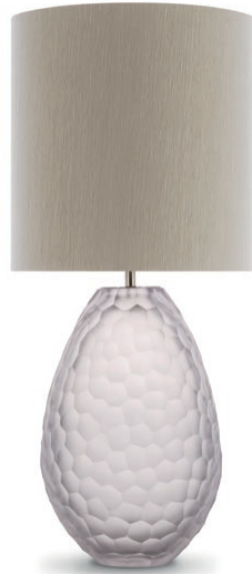
EYRE TABLE LAMP

Indigenously known as Kati-Thanda, Lake Eyre is usually cinder dry, the lakebed blanketed by a patchwork of tessellating salt segments, as reflected by the scalloped surface of our Eyre table lamp. Of the 5 new colourways, Blush Pink is of particular note - an emulation of the natural phenomenon which takes place when the lake is flooded, bringing a flourish of salt-loving algae and halobacterium who turn the waters a brilliant pink.