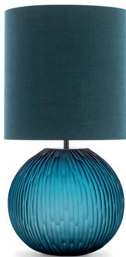
CYPRESS TABLE LAMP

TL236 BLUSH PINK & BRUSHED NICKEL 27CM [10,5"] DIAMETER X 31CM [12"] HIGH SHOWN WITH 11" TALL DRUM SHADE