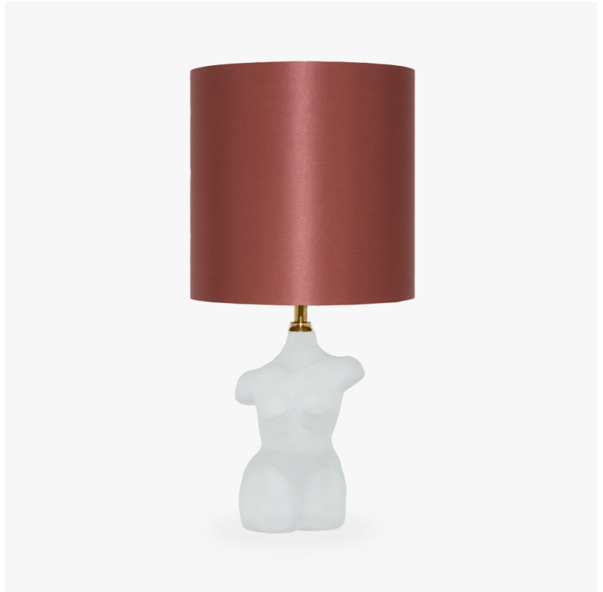
TL814 in Frosted Glass and Polished Brass with 9" Tall Drum Shade in Bennett's 1806/306

Goddess of love and beauty, Venus encompasses femininity and will bring a graceful presence to your interior setting. This refined sculpture is honed from solid Italian glass and embellished with brass fixings. We offer Venus in clear glass for a gentler aura or a satin finish which echoes the glowing presence of her namesake planet, the brightest object in our night sky beyond the Moon, a true object of desire.