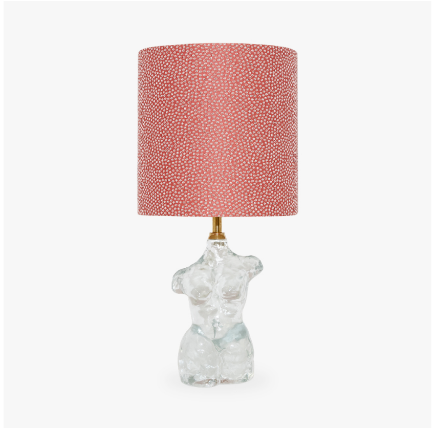
TL814 in Clear Glass and Polished Brass with 9" Tall Drum Shade in James Hare Shagreen Coral 31537-24

Goddess of love and beauty, Venus encompasses femininity and will bring a graceful presence to your interior setting. This refined sculpture is honed from solid Italian glass and embellished with brass fixings. We offer Venus in clear glass for a gentler aura or a satin finish which echoes the glowing presence of her namesake planet, the brightest object in our night sky beyond the Moon, a true object of desire.