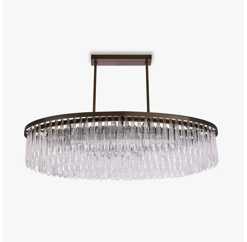
CL463-3T-O-120 in Clear Scallop Glass and Antique Brushed Brass