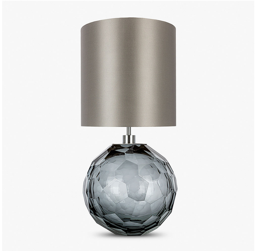
TL710-LA in Petrol Blue & Clear with Brushed Nickel with a 12" Tall Drum Shade in 1806W/ 44 Silver