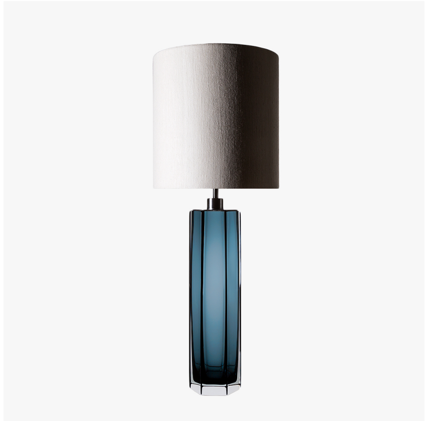
TL704-LA in Petrol Blue and Clear with a Brushed Nickel Top and a 12" Tall Drum Shade in Silk Linen 3998W White