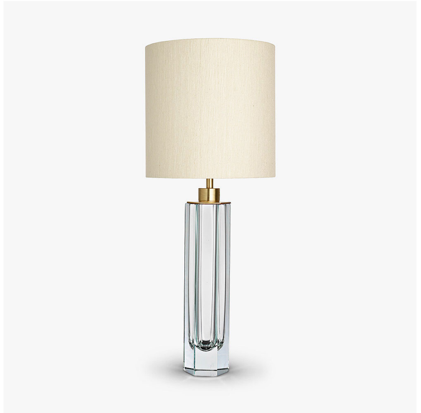
TL704-SM in Clear Murano Glass with Brushed Gold and 10" Tall Drum Shade in Bennett's Silk Linen 3998W