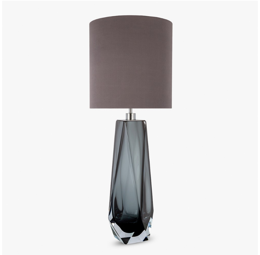
TL703-XL in Petrol Blue & Clear and Brushed Nickel with a 13" Tall Drum Shade in Bennett Silks Dupion Silk 5018W-86 Prussian