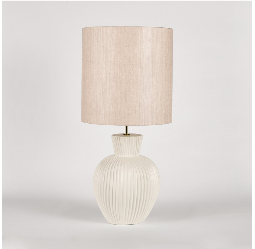
TL160 in Chalk and Polished Brass with 13" Tall Drum in James Hare Vyne Silk Rose Quartz 31625/13

IEC (International Electrotechnical Commission) test certificates available - will incur a surcharge UL (Underwriters Laboratories) test certificates available for the USA - will incur a surcharge Suitable for Yachts - Rod and bolting available for use on yachts