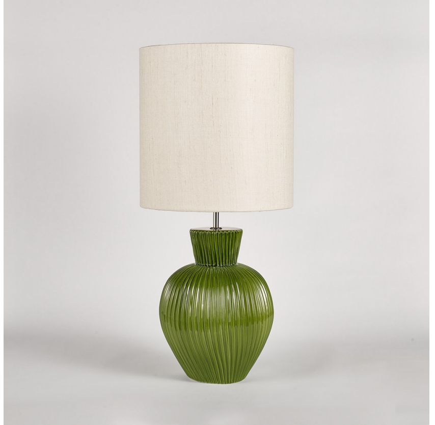
TL160 in Ivy and Polished Nickel with 13" Tall Drum Shade in James Hare Vienne Silk Chalk 31458/01

IEC (International Electrotechnical Commission) test certificates available - will incur a surcharge UL (Underwriters Laboratories) test certificates available for the USA - will incur a surcharge Suitable for Yachts - Rod and bolting available for use on yachts