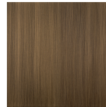
Antique Brushed Brass