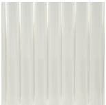
Clear Lucite Rods