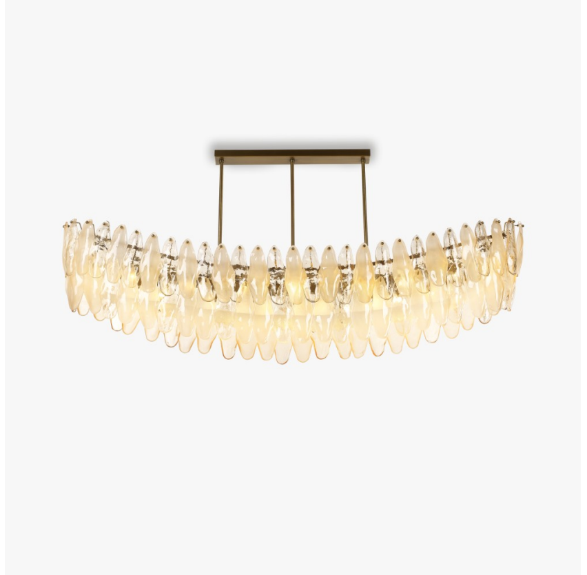
CL850-CO in Champagne and Champagne Satin with Brushed Dark Bronze

The presence of energy and movement cannot always be explained; a phantom, a mirage or a ghost. Our Spectre range takes on a somewhat ethereal form with its amorphous shapes and diaphanous presence. Created from a new suspended glass fixing, the Spectre ceiling lights appear to hover in mid-air and hint at the vestige of energy where life may once have been. Offered in a mix of clear glass with spectral satin glass elements, the dappled light effect that this creates disrupts any defined outline and produces a softness and a gentle vision for your interior setting. In a design first for Bella Figura, this variation of the classic round design is available in a unique curved oval shape that evokes images of an other-worldly ghost ship cutting through uncharted waters.