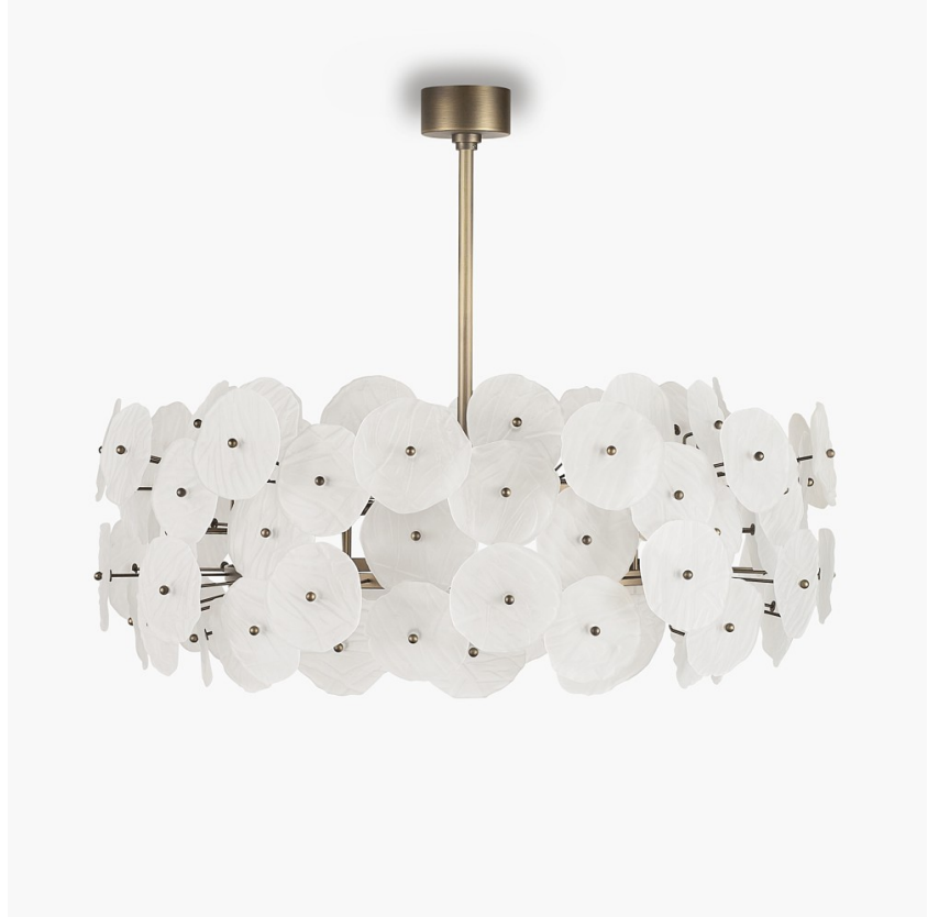
CL207-SM in Satin Glass and Brushed Dark Bronze