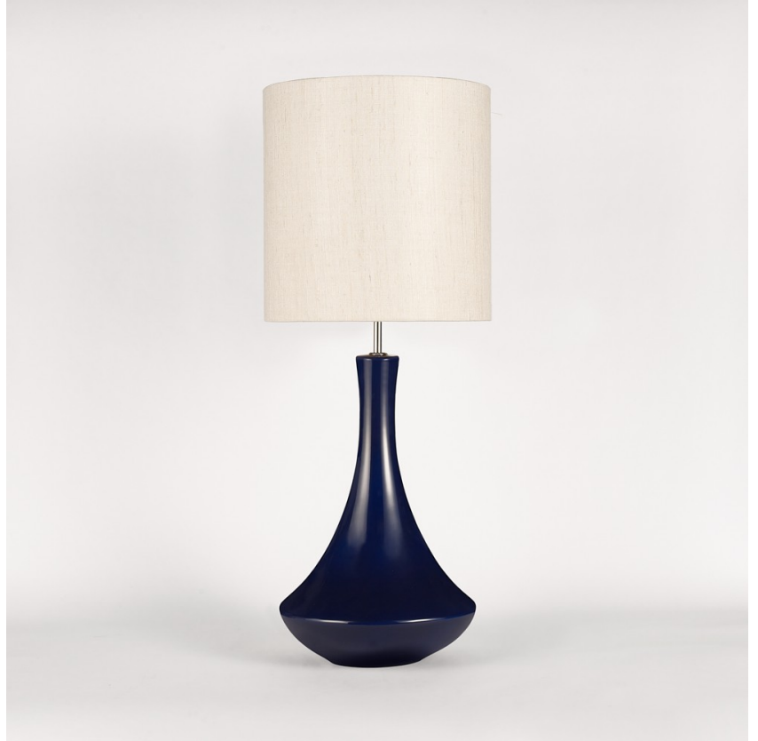
TL162 in Admiral Blue and Polished Nickel with 13" Tall Drum Shade in James Hare Vienne Silk Chalk 31458/01

The fruit from the tree of the Pyrus genus – the humble pear, the perfect name for our latest ceramic design. Curvaceous but sleek, our Pyrus lamp renews this classic pear shape, creating a chic outline for superior interior styling. Illuminated by six new glossy glazes, this piece is as versatile as it is vivacious.