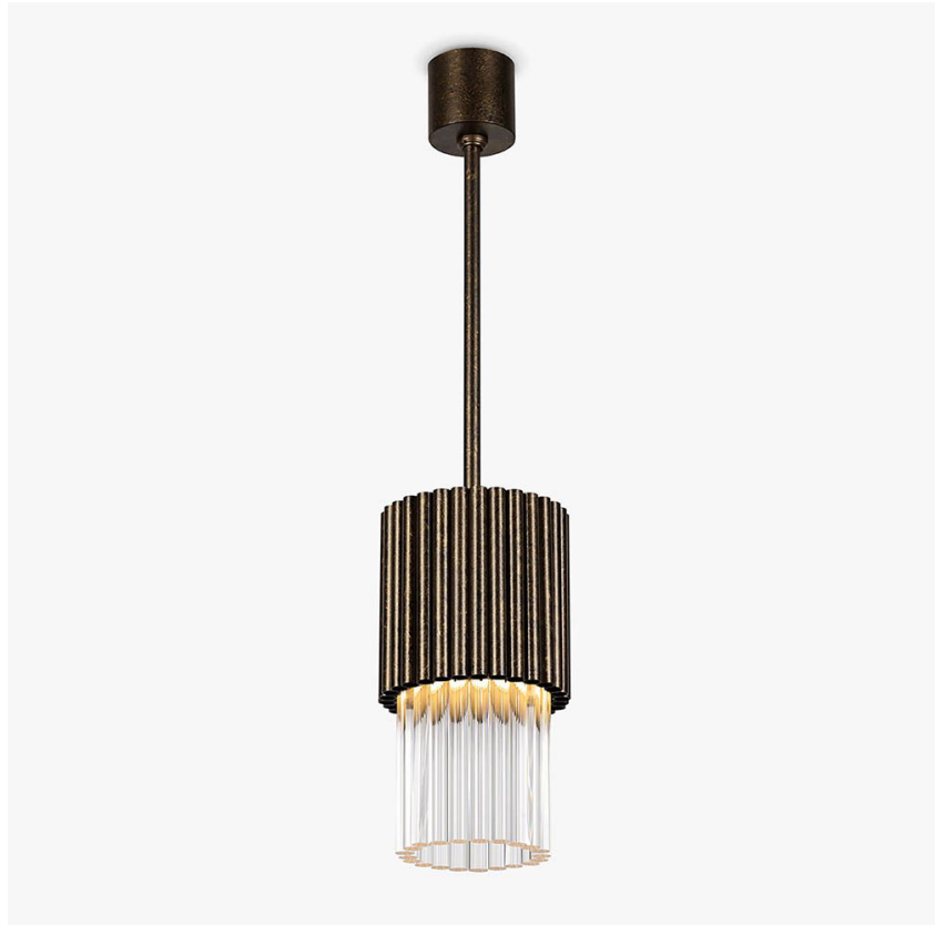
CL108-PEN in Clear Lucite Rods and Stippled Bronze Rods

IEC (International Electrotechnical Commission) test certificates available - will incur a surcharge