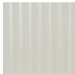
Frosted Lucite Rods