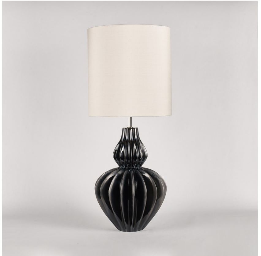
TL825 in Oil and Polished Nickel with 14" Tall Drum Shade in Bennett's Dupion Silk Hint of Pink 5018/50X

Required modifications for use on yachts - lacquer applied to all metal components, "sea rod" through centre to secure base to surfaces, with the cable exit through bottom of the base.