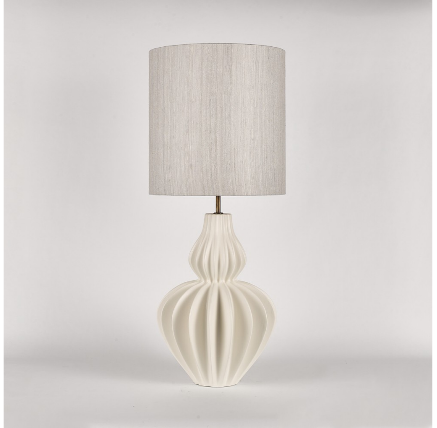
TL825 in Chalk and Old English Brass with 14" Tall Drum Shade in James Hare Vyne Silk French Grey 31625/10

Required modifications for use on yachts - lacquer applied to all metal components, "sea rod" through centre to secure base to surfaces, with the cable exit through bottom of the base.