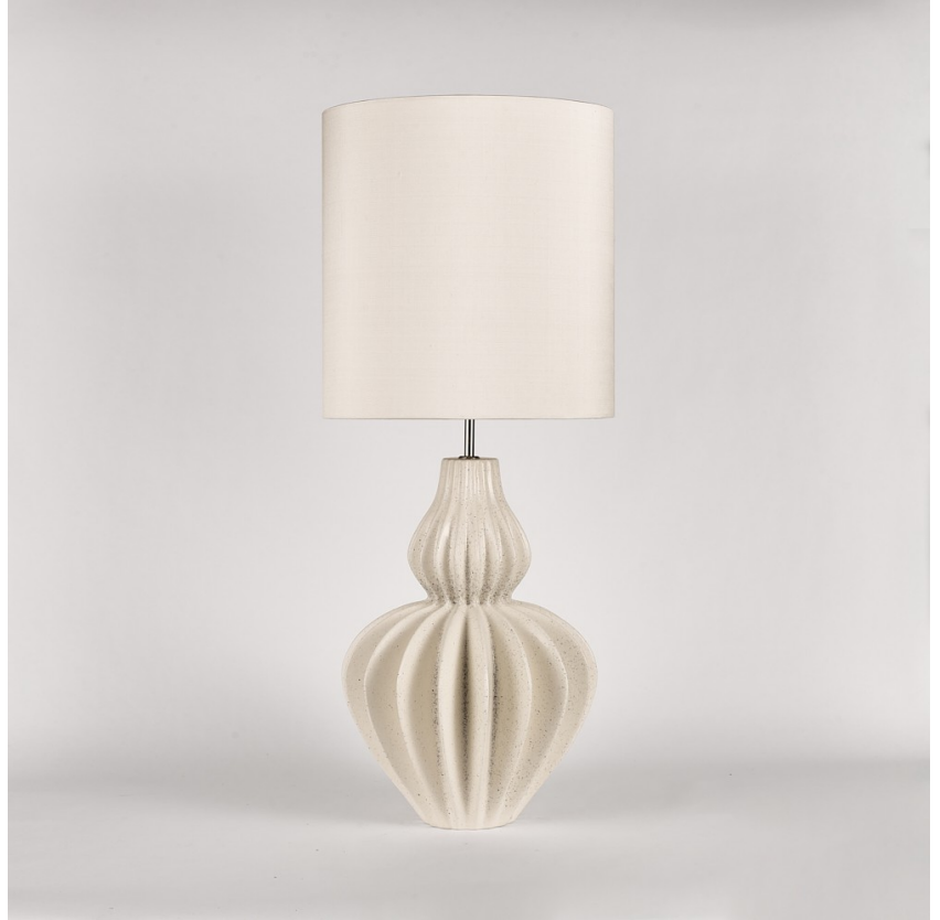
TL825 in Jasper and Polished Nickel with 14" Tall Drum Shade in Bennett's Dupion Silk Hint of Pink 5018/50X

Required modifications for use on yachts - lacquer applied to all metal components, "sea rod" through centre to secure base to surfaces, with the cable exit through bottom of the base.