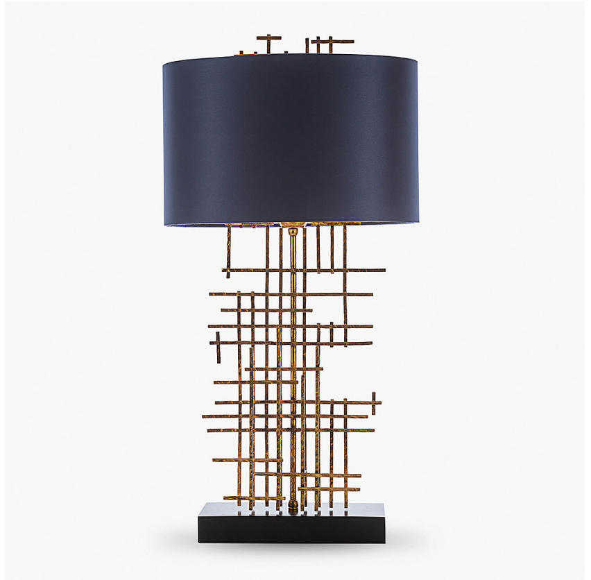
TL59 in Antique Gold Leaf with an Ebony Resin Base with a 15" Oval Drum Shade in Crepe Satin 1806W/ 86 Prussian