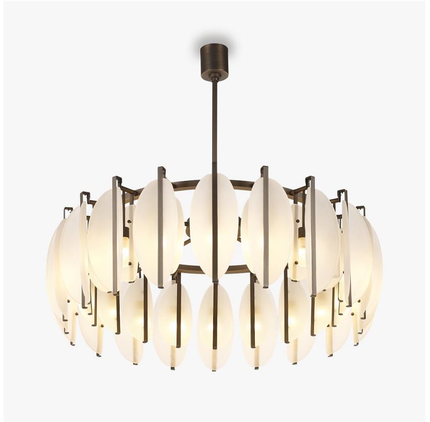
CL852 in Satin and Brushed Dark Bronze