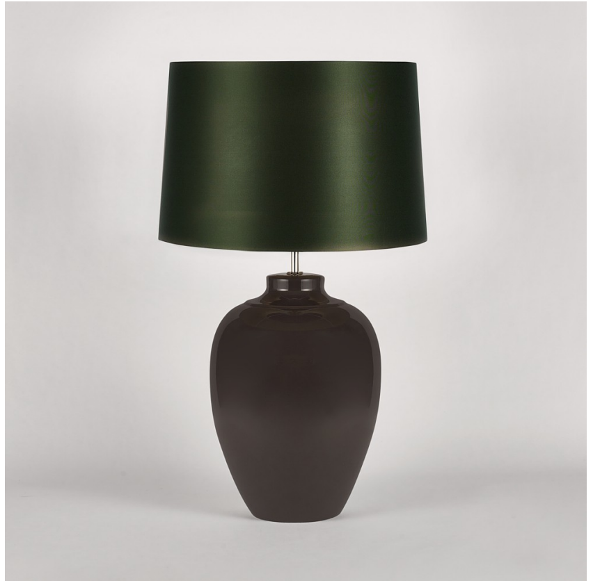
TL163 in Beluga and Polished Nickel with 16" Melton Shade in Bennett's Crepe Satin Dill 1806W/120

The Mela table lamp, which takes its name from the Italian word for 'apple', is a rejuvenation of the traditional urn shape with six new finishes to adorn its voluptuous form. This creation is truly the apple of our eye.