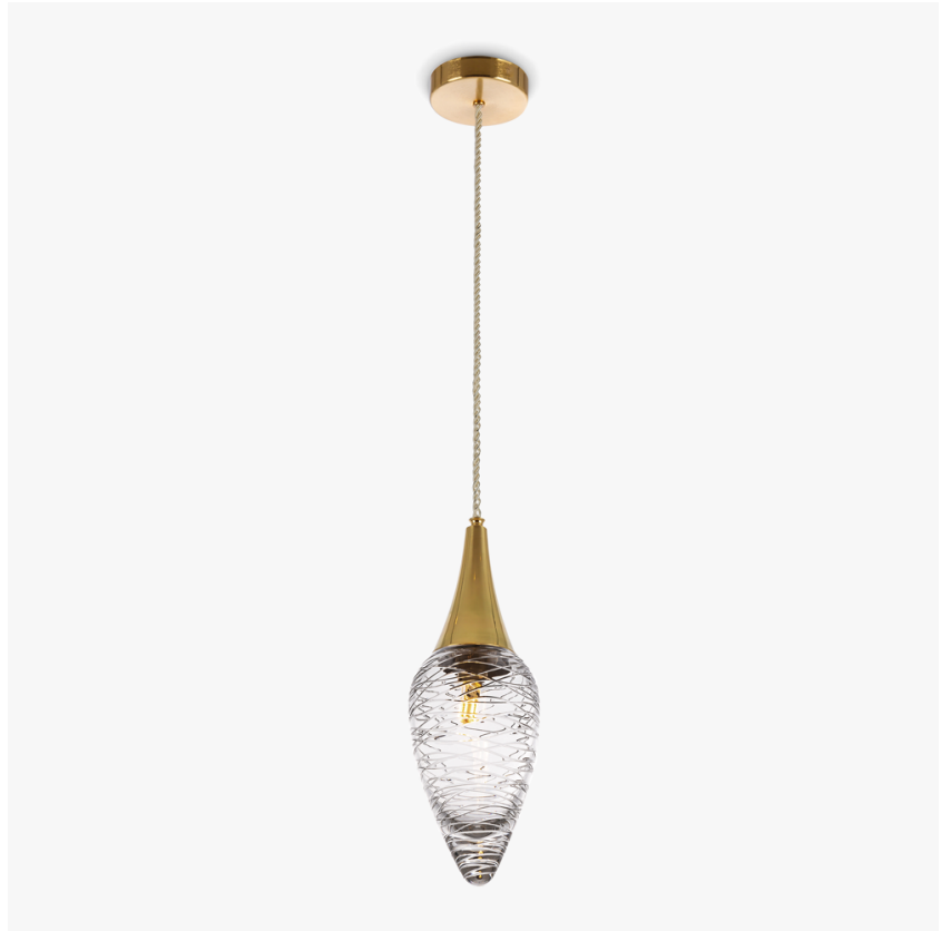
CL378 in Clear Lead Crystal and Polished Brass with Silver Flex