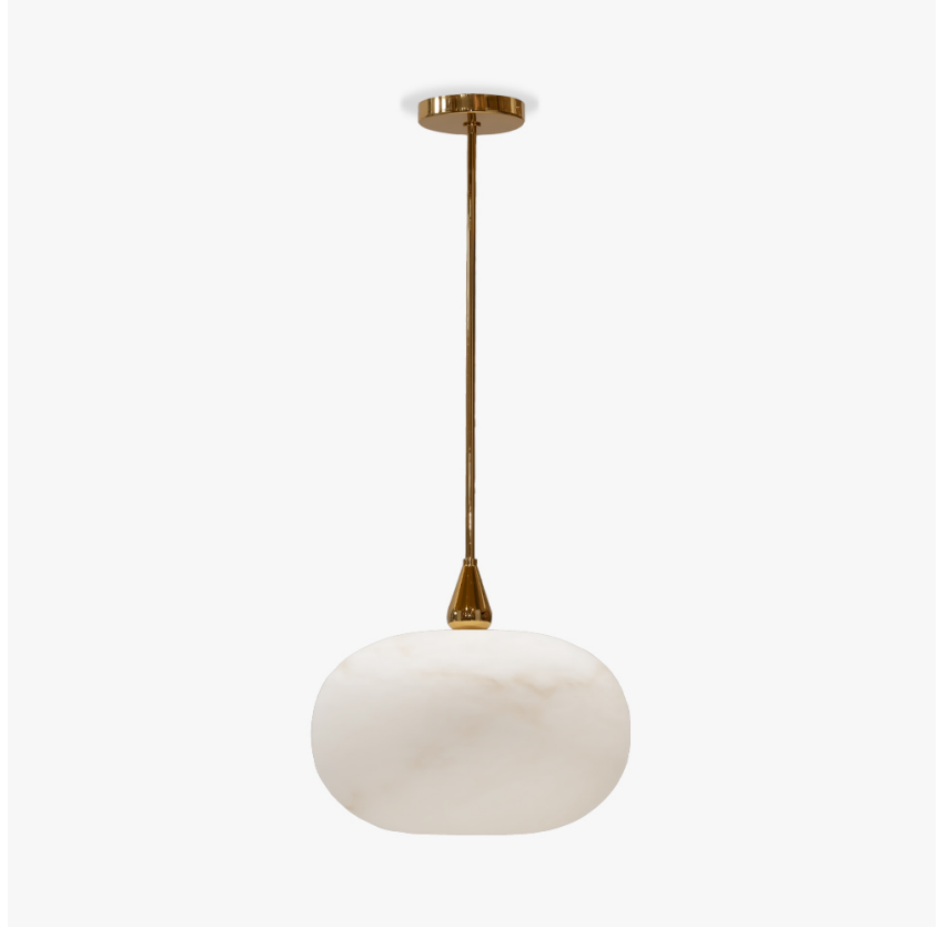
CL809 in Alabaster and Polished Gold

This enchanting pendant light is striking on the eye and by Jove, we love it. Jove gains its name from the earlier name for the sovereign deity Jupiter, but it is not only in name that our Jupiter and Jove pendants mirror each other. Both styles are carved from a solid block of alabaster and once the shape is revealed, so too is the intricate network of veins which weave their way through this rock. Alabaster has a smooth appearance which possesses dreamlike qualities when lit due to the varying degrees of translucency in the mineral veins, these natural characteristics deliver a captivating aura and a luxurious warm glow which elevates any space.