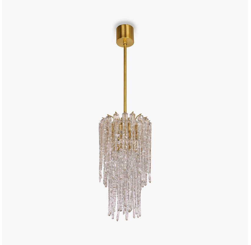
CL800-PEN in Satin and Brushed Gold