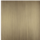
Brushed Dark Bronze