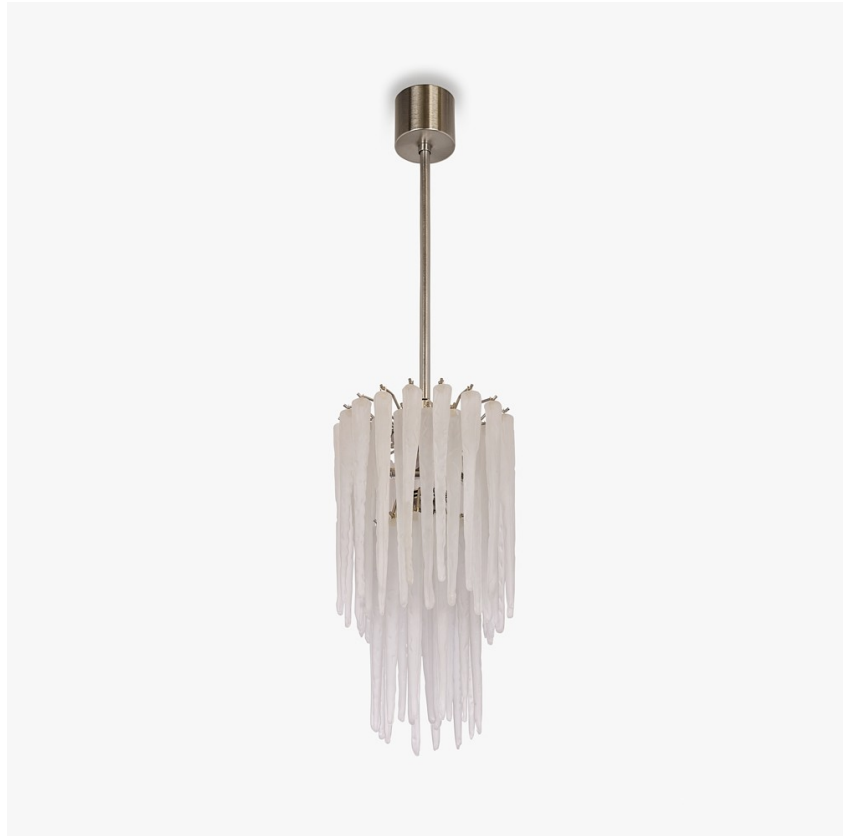
CL800-PEN in Satin and Brushed Nickel