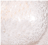
Clear Bubbled Glass