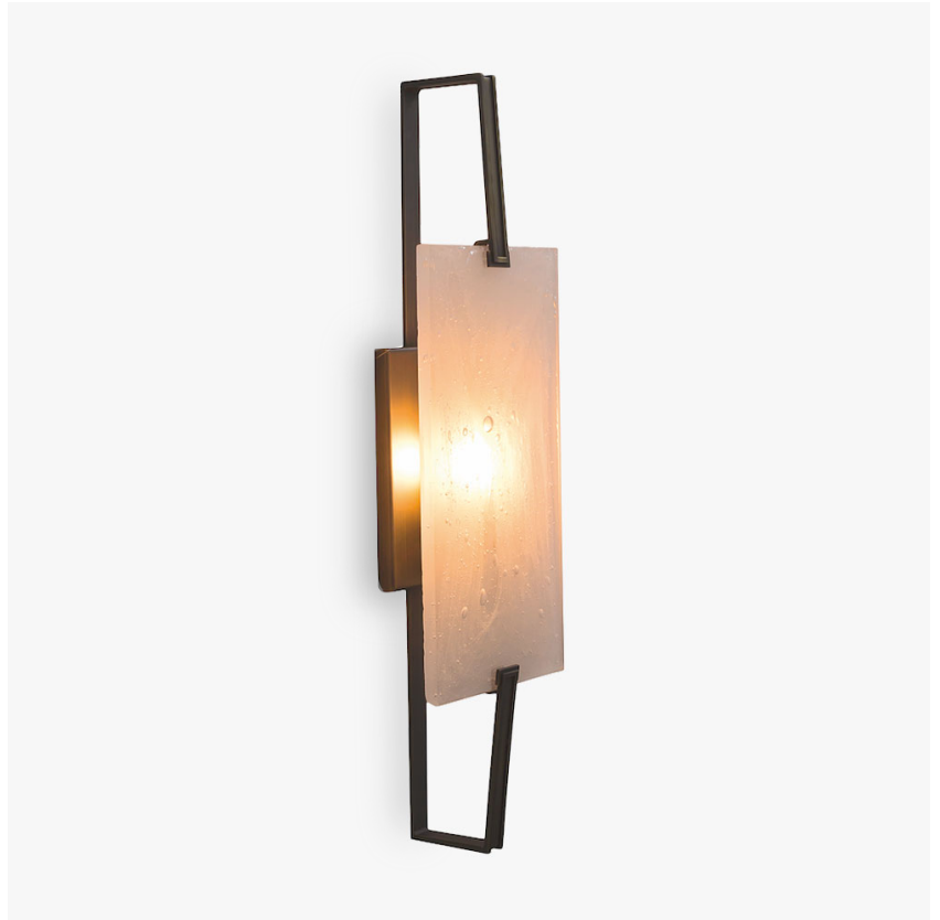
WL550 in 'dry Ice' Murano Glass and Brushed Dark Bronze

UL (Underwriters Laboratories) test certificates available for the USA - will incur a surcharge