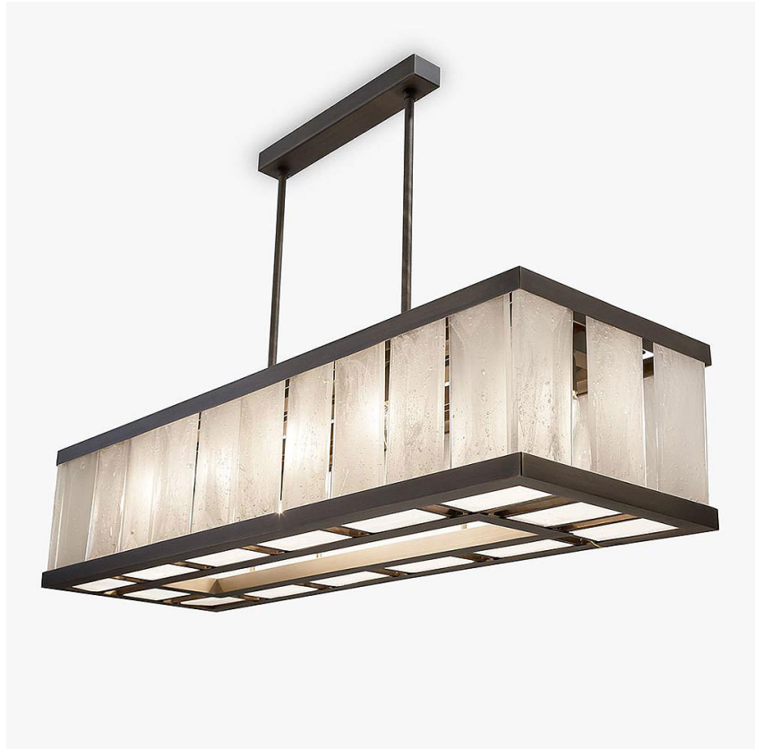
CL550-Rectangular in 'dry Ice' Murano Glass and Brushed Dark Bronze

IEC (International Electrotechnical Commission) test certificates available - will incur a surcharge UL (Underwriters Laboratories) test certificates available for the USA - will incur a surcharge