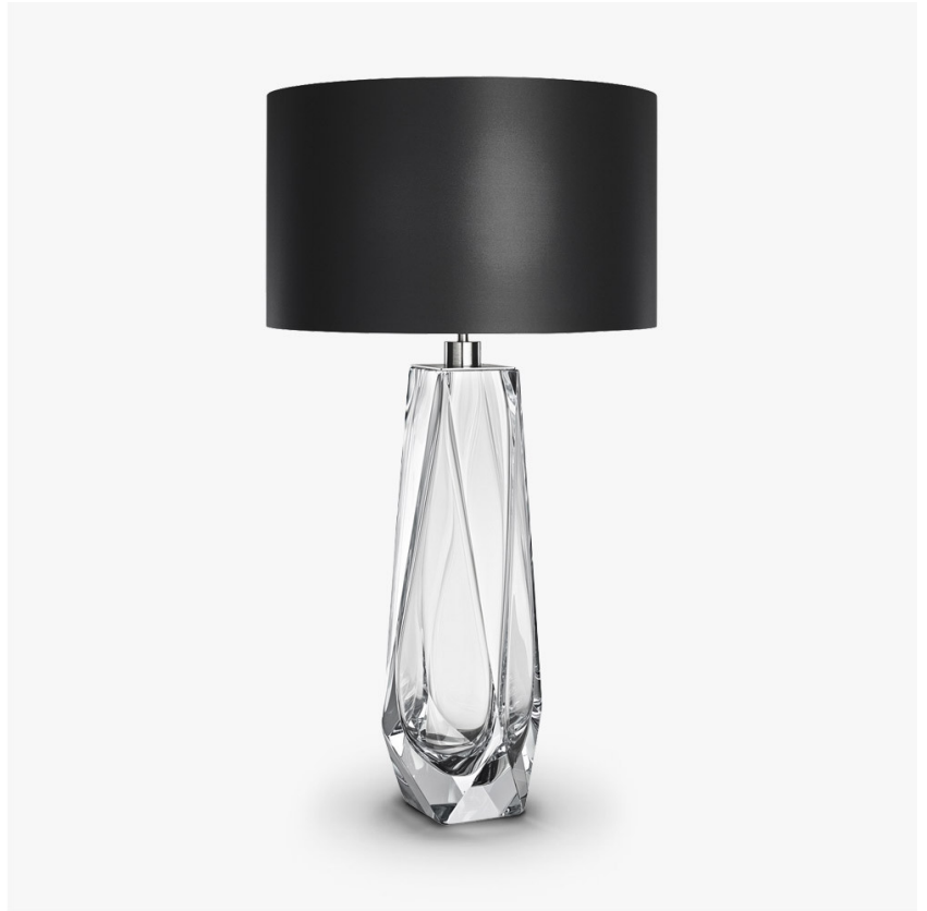
TL703-XL in Clear Murano Glass and Brushed Nickel with a 17" Short Drum Shade in 1806W Black