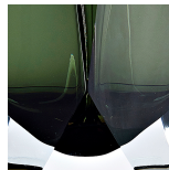
Forest Green & Clear