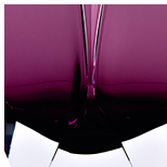
Amethyst & Clear