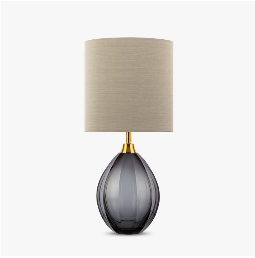
TL711-SM in Petrol Blue Murano Glass with a 8" Tall Drum Shade in James Hare 38000/91