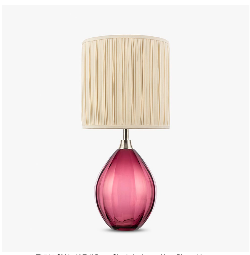
TL711-SM in 8" Tall Drum Shade in James Hare Pleated Ivory