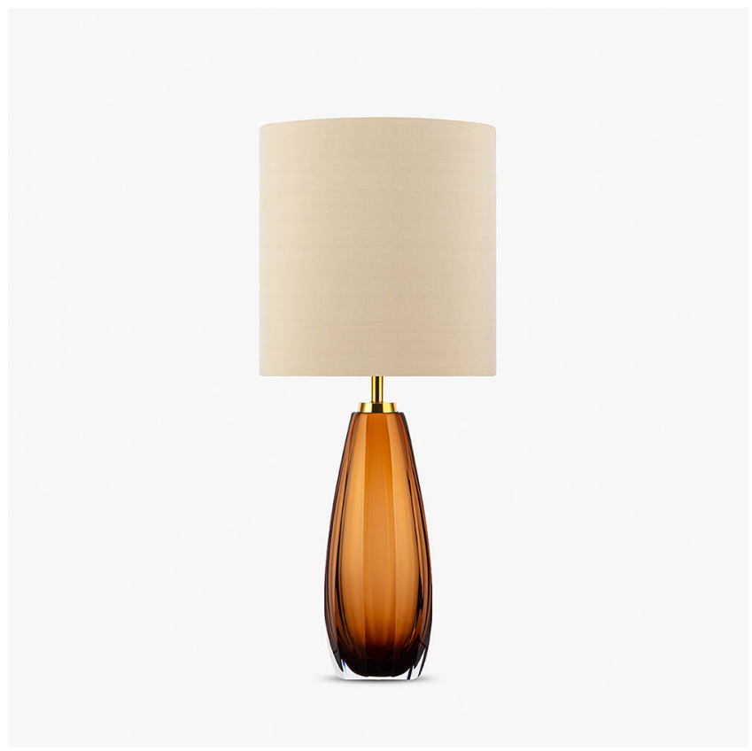
TL712-SM in Tobacco & Clear Murano Glass with a 10" Tall Drum Shade in 5018W-