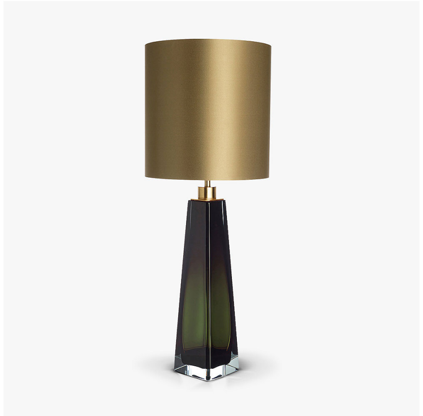
TL709 in Forest Green & Clear with Brushed Gold and 11" Tall Drum in 1806W-310 Timber Wolf