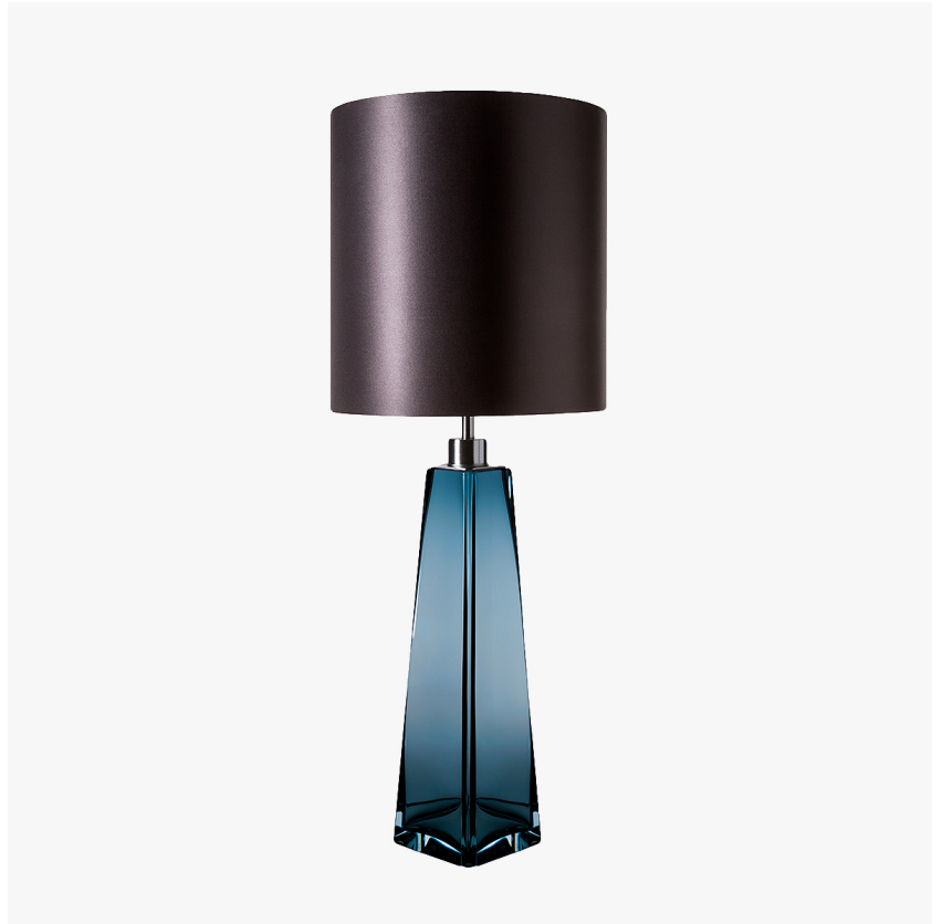
TL709 in Petrol Blue & Clear and Brushed Nickel with 11" Tall Drum in 1806W-570 Old Navy