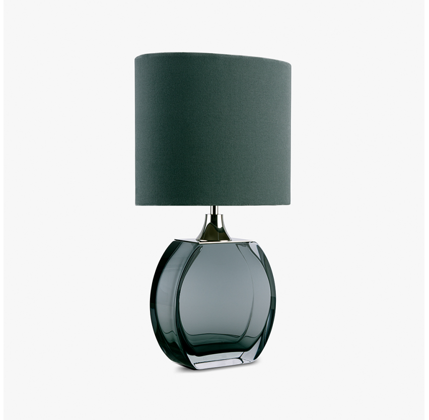
TL713-SM in Petrol Blue & Clear and Polished Nickel with a 12" Oval JH Velvet 8308/12 Blue Grey