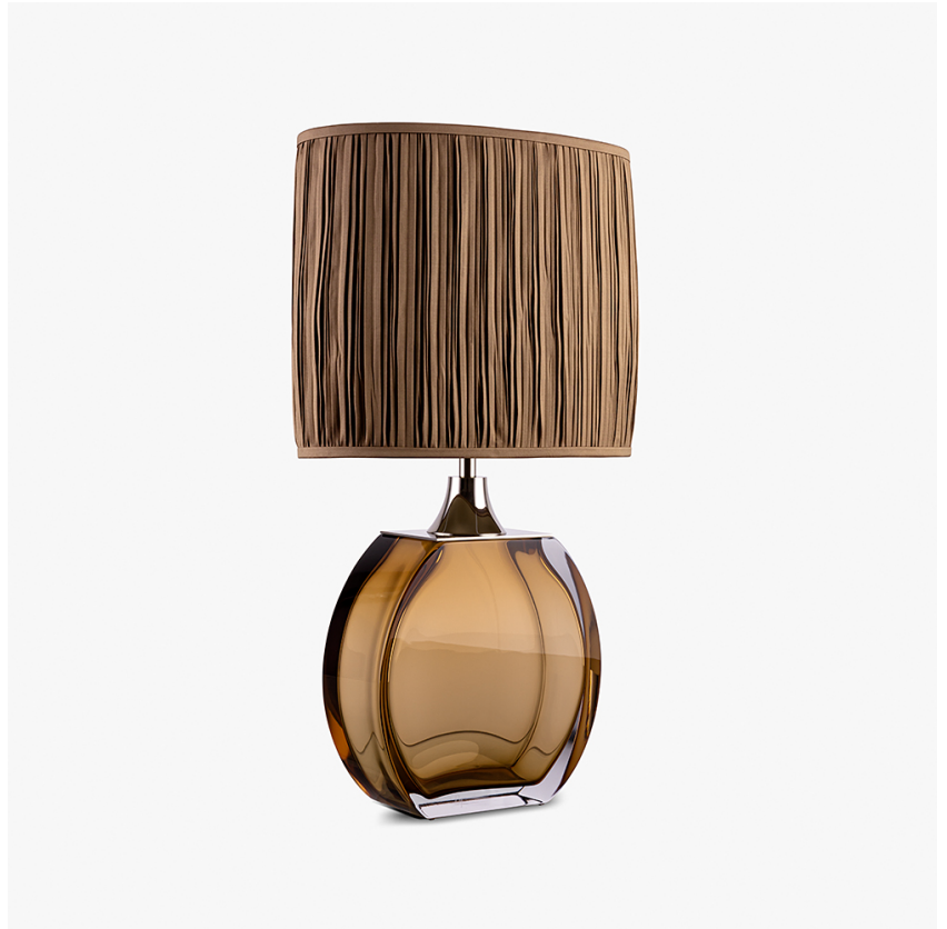
TL713-SM in Tobacco & Clear and Polished Nickel with a 12" Oval Shade in 38000/91