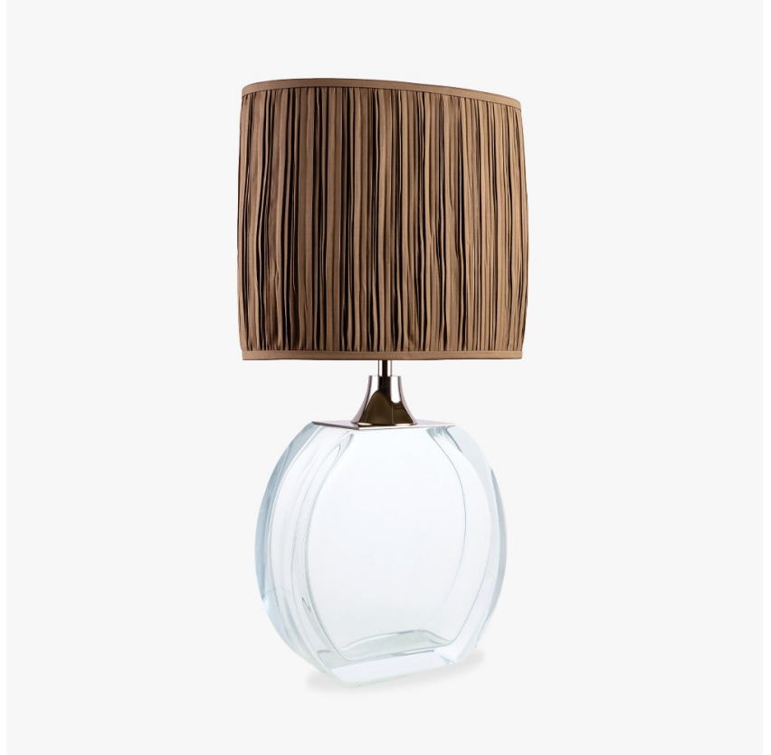
TL713-SM in Clear and Polished Nickel with a 12" Oval Shade in 38000/91