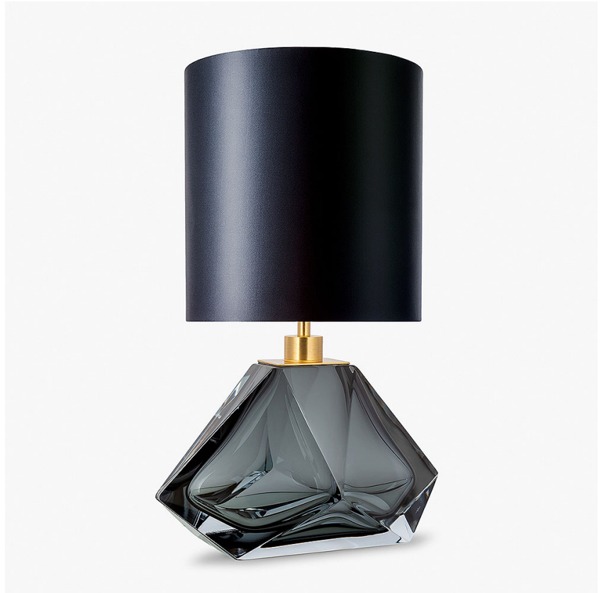
TL700 in Petrol Blue with a 11" Tall Drum Shade in Silk Crepe Satin 1806W-019 Indian Ink