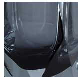
Slate & Clear