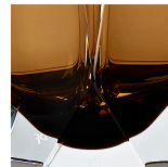
Tobacco & Clear