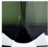
Forest Green & Clear