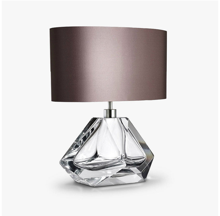
TL700 in Clear Glass and Brushed Nickel with a 15" Straight Oval Shade in Silk Crepe Satin 1806W-326 Nutmeg