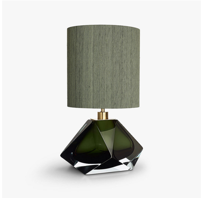
TL700 in Forest Green and Clear and Brushed Gold with a 11" Tall Drum Shade in Silk Linen 3998-0117 Vineyard Green