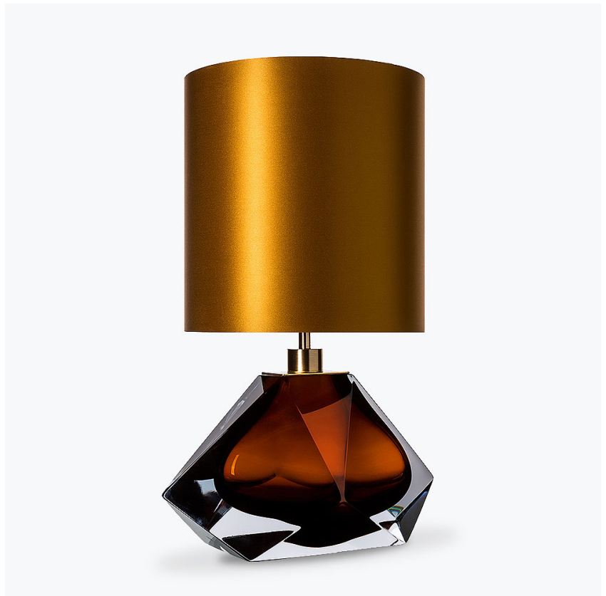
TL700 in Tobacco & Clear Glass and Brushed Gold with a 11" Tall Drum Shade in 1806W-70 Ochre