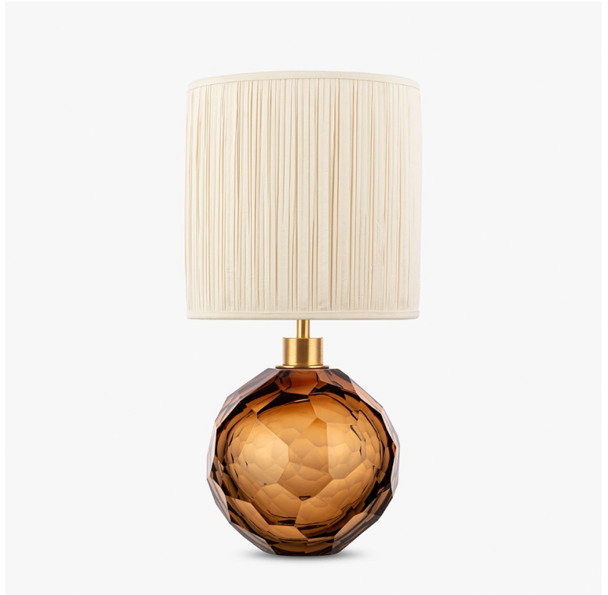
TL710-SM in Tobacco & Clear and Brushed Gold with 9" Tall Drum Shade in Pleated James Hare 38000/01