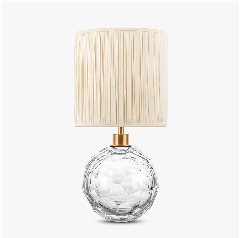
TL710-SM in Brushed Gold and Clear Glass with 9" Tall Drum Shade in Pleated JH3800/01 Ivory