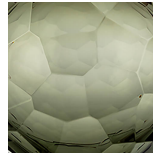
Forest Green & Clear (Round)