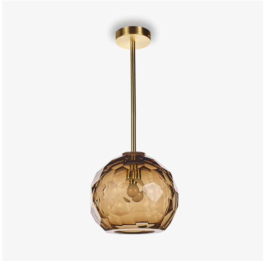
CL710 in Tobacco and Brushed Gold

This pendant version of our Diamond Round Table Lamp is the very first time a design from our iconic Beverly Hills collection has been adapted for ceilings. The elegant, faceted ball shape allows the light to refract and form a beautiful honeycomb pattern. Hand-crafted out of layered Murano glass and then polished by hand for up to 12 hours, each piece is a one-of-a-kind of unrivalled quality.