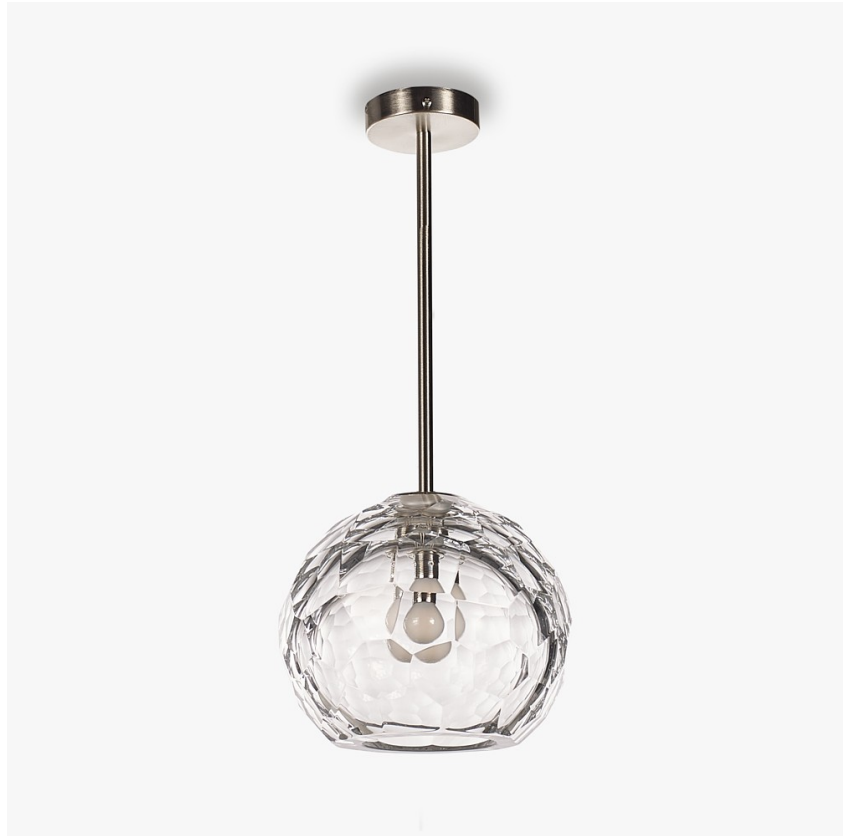
CL710 in Clear and Brushed Nickel

This pendant version of our Diamond Round Table Lamp is the very first time a design from our iconic Beverly Hills collection has been adapted for ceilings. The elegant, faceted ball shape allows the light to refract and form a beautiful honeycomb pattern. Hand-crafted out of layered Murano glass and then polished by hand for up to 12 hours, each piece is a one-of-a-kind of unrivalled quality.