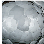
Slate & Clear (Round)