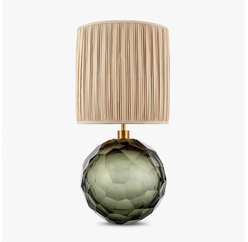
TL710-LA in Forest Green & Clear with Brushed Gold with a 12" Tall Drum Shade in Pleated James Hare 38000/103